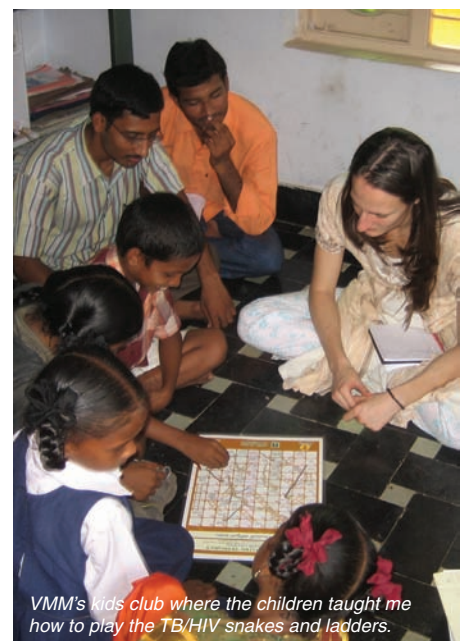
VMM's kids club where the children taught me how to play the TB/HIV snakes and ladders.

"Coming into contact with VMM has been a lifeline"