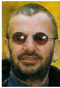
Ringo Starr – the Beatles drummer who fronted the TB Alert Appeal on Radio 4

Last autumn many of you generously responded to the Development Appeal , intended to help TB Alert jump up a gear and respond to heightened awareness of TB after the Leicester outbreak. Almost £6000 was given in one-off donations and, even more valuable to a charity in the long term, regular giving (Standing Order) commitments amounted to a further £1,400 a year. Claiming back tax from the Inland Revenue through Gift Aid will enhance both of these figures.